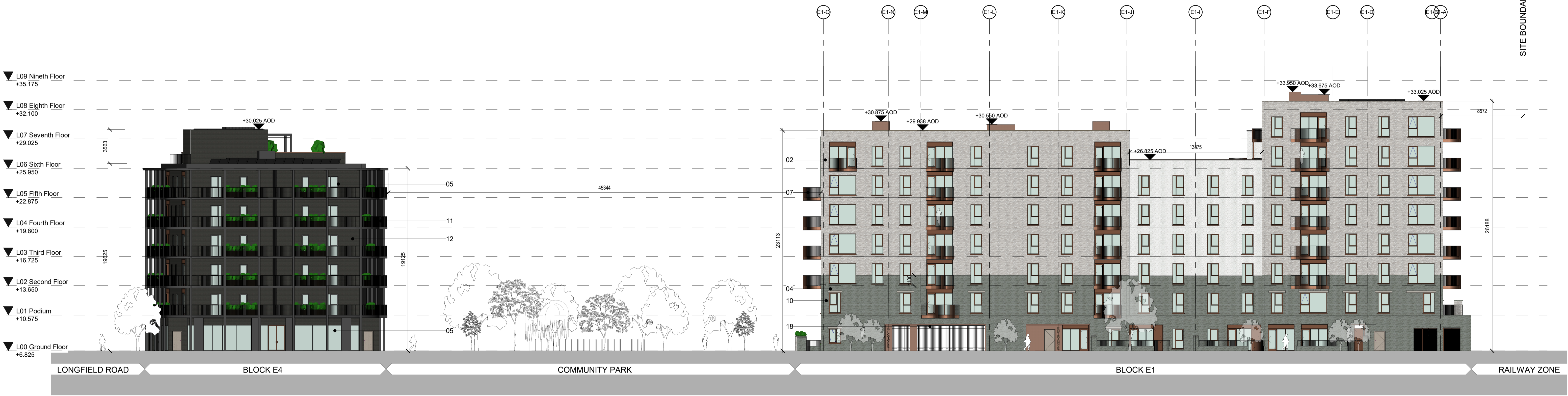
1 Block E1/2 - E4 NORTH ELEVATION 1 : 200